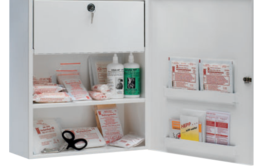
Ref. No. 45610