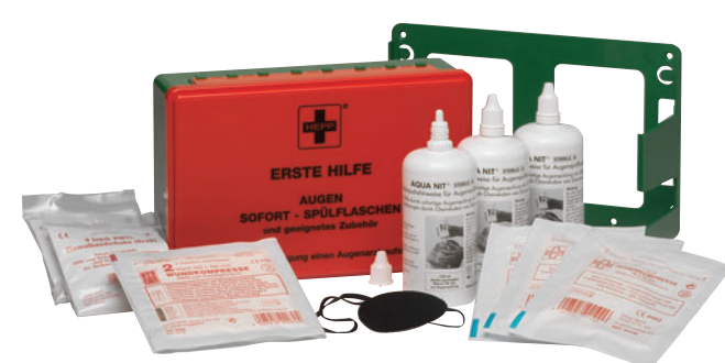
Ref. No. 91095

The German occupational health insurance institutions stipulate for most factories only the keeping of first-aid material in accordance with the requirements of DIN 13 157 and DIN 13 169. Large companies however, because of the requirements of the occupational health insurance institutionsfor health and safety at work, must have in addition stretchers and fire blankets ready for immediate use in an emergency. In our range we also have special articles for individual industrial areas (e.g. laboratories, chemical industry) such as our first-aid box "Eyes", which is designed for immediate initial treatment of injuries around the eyes.