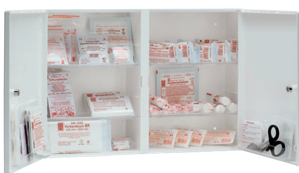
Ref. No. 45560

All cabinets are lockable and have additional shelves in the doors on which to stand items. The shelves in the cabinet can be adjusted in height by inserting pegs into a grid of holes to suit your requirements. There is sufficient space to arrange the specified first-aid materials so that they can be easily seen and still add the company-specific first-aid products (e.g. eyewash bottles). The one-door plastic cabinet has two drawers underneath, which are easily accessed and are suitable for frequently required first-aid materials (such as plasters).