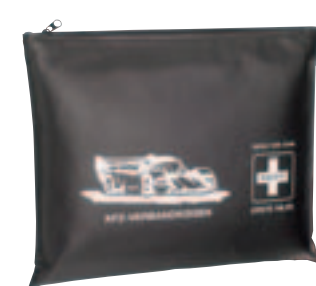
Ref. No. 21200

The cushion casing holds the DIN 13 164-compliant contents. The first-aid materials, clearly arranged and protected from dust in twinsectioned pouches, can be easily taken out.