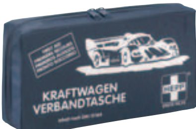
Ref. No. 25882