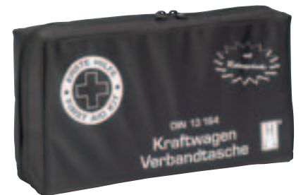
Ref. No. 25875