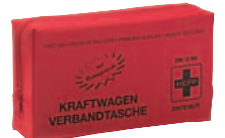
Ref. No. 25850