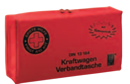
Ref. No. 25880