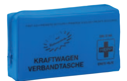
Ref. No. 25600