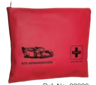
Ref. No. 22300