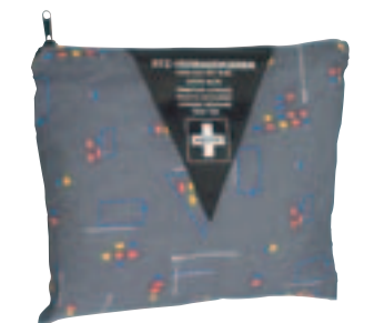
Ref. No. 23290