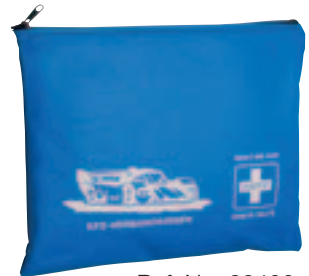
Ref. No. 22400