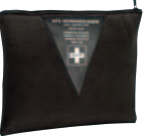
Ref. No. 26100